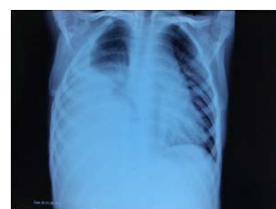
Figure 1. Chest- Xray

Figure 1 showed a homogenous opacification in the right lower zone with the opacity seen to track along the lateral chest wall. The right costophrenic angle is obliterated. Findings are suggestive of a right side pleural effusion. Table 2