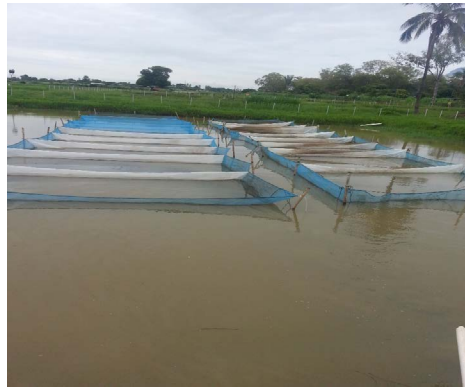
Figure 3. Fry counting.