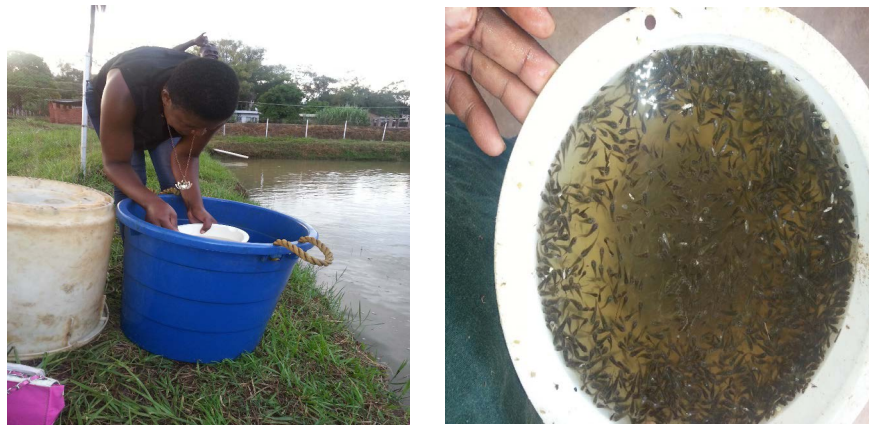
Table 1. Effect of sex ratio on fry production.