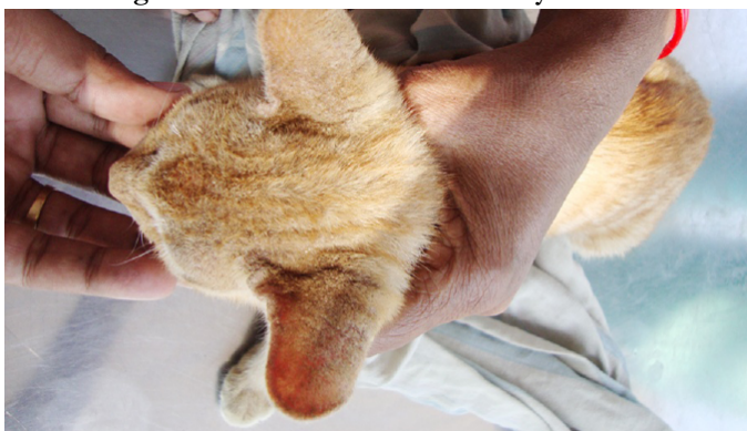
Figure 1: Skin lesions over the body in a cat