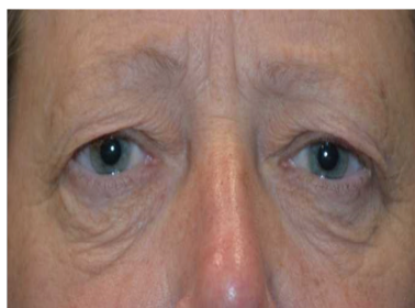
Figure 2. Same Patient after Surgery; Right Eye without Cutting Orbicularis Muscle.