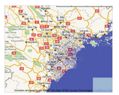
Hanoi ngâ.p 2 met