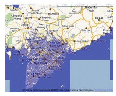
Saigon under 4 meters

The destruction of the nuclear plant in North Japan on 2011 resulted from the above process ! After this catastrophe, all the nuclear plants have been arrested for non function. But last month, the Sendai reactor is started again in service ! What a big danger!