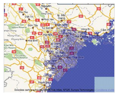
Hanoi under4 meters