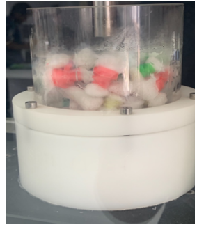
Figure 1. Showing the thermocycling of the samples in the chewing simulator. Thermocycling was done alternatively at hot and cold temperatures ( 5°C and 55°C).

From the results obtained it was found that 2 different graphs were obtained. Table 1 represents the delta E value of the 2 commercially available composites. The values of the 10 samples of restofill being 5.424, 9.529, 12.66, 15.04, 8.779, 7.656, 10.49, 8.744, 10.20 and 8.86. The values for te-econom plus being, 3.277, 3.636, 6.027, 3.382, 18.45, 4.839, 3.055, 3.513, 4.692 and 5.941. Table 2 shows the standard deviation, p values and mean of the 2 commercially available composites. The p-value was found to be 0.550, the p-value being greater than 0.05, the p-value is insignificant. The mean value of the composites restofill and te-econom plus are 9.74320 and 5.68120 respectively. The standard deviation of restofill is 2.658911 and for te-econom plus is 4.615969. Figure 1 shows the comparative delta E values of the two commercially available composites.