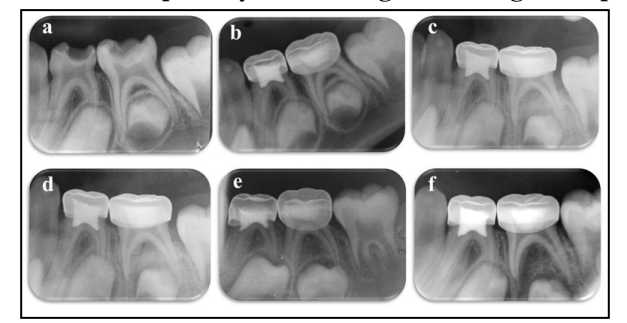
figure (2-a): preoperative x-ray, figure (2-b): post-operative x-ray, figure (2-c): 3 months post-operative, figure (2-d): 6 months postoperative, figure (2-e): 9 months postoperative, figure (2-f): 12 months postoperative

Figure 2. Showing a 6 years old girl was complaining of pain with eating related to the lower left quadrant. Pulpotomy was done to the lower-left second primary molar using Aloe vera gel as a pulpotomy agent.