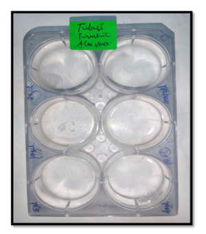
Figure 2: Cytotoxic effect on day 1 and 2shows number of live nauplii in 5µL, 10 µL, 20 µL, 40 µL and 80 µL concentrations.

Figure 1: Elisa plate containing shrimps at 5µL,10µL,20µL,40 µL and 80 µL.