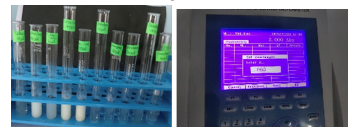
Table 1. The preparations were measured in a single beam UV spectrophotometer. The preparations were measured in a single beam UV spectrophotometer and the absorbance value was recorded at 660nm. Both samples were measured and calculated.

Figure 1. Shows the anti-inflammatory activity which two preparations were prepared standard and Cu NPs preparation which preparation were heated for 1 hour and to detect anti-inflammatory activity by Uv-spectrometer with a wavelength range 660.