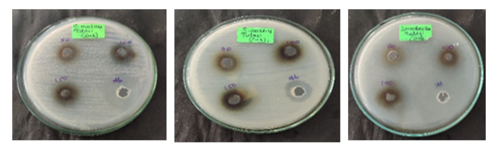
Table 2. Shows antimicrobial activity tests done at different concentrations 50 µl, 100 µl and 150 µl of which bacteria grows. The bacterial growth was counted in each concentration and antibiotic of each bacteria is observed.

Figure 2. Shows the zones of inhibition for the microbes Streptococcus mutans, Streptococcus aureus and Lactobacillus for the prepared extract.