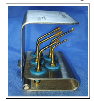
Figure 1. Inserts of mectron piezo device.

All surgical procedures were performed by the same operator. After preparing the patient, sterilizing the surgical field with povidone 2% and performing local anesthesia, a surgical incision was made on the top of the socket to raise a full-thickness periosteal mucous flap while preserving the periosteum without rupture so that the bone was exposed in the target area, the implant cite was prepared using PL1 up to the sinus floor, then using PL3 for cylindrical site preparation, after that using PL2 to sinus floor consumption and membrane piezo-lift (Fig.2), and then using PL3 to lift the sinus membrane by hydraulic action and bone grafting with cavitation effect. A nose-blowing test was performed after