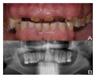
Figure 3. A) Intraoral examination showing severe tooth wear in both arches. B) Initial panoramic radiography.

Figure 2. A) Intraoral examination showing severe tooth wear in both arches. B) Initial panoramic radiography.