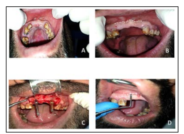
Figure 1. Clinical photos shows: A) initial situation of the case, B) initial width of attached gingivaequal 5 mm, C) final drills translucency under the bone, D) attached gingiva width 5.7 mm 4 months after surgery at T2 time.

• After applying the bone graft in place, 2-4 minutes were waited