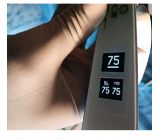
Figure 5. Buccal-Lingual absorptiometry.