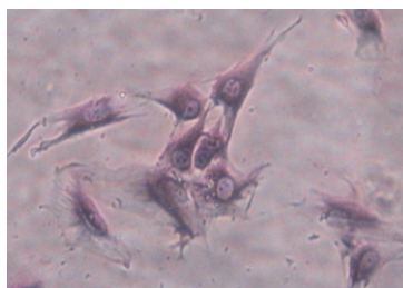
Figure 2. Negative keratin staining blue nucleus, no staining of cytoplasm.