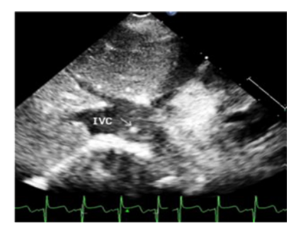
Figure 3. TTE in parasternal long axis view shows VSD closed by huge vegetation.