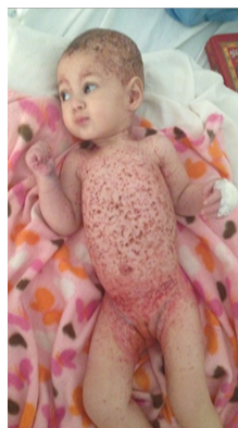
Figure 1. Jaundice and Erythematous - Vesical - Crustry - Purpuric Lesions on the Scalp, Trunk and Diaper Area.

jaundice, widespread petechias, telangiectasias, small erythematous papules, ulcerative-necrotic lesion and erythematous-vesical-crusty-flaky-purpuric lesions on the scalp, trunk, extremities of upper limbs (especially palmar region) and diaper area. There was also a necrotic lesion on the palate and purpuric-hemorrhagic lesions on the oral cavity.