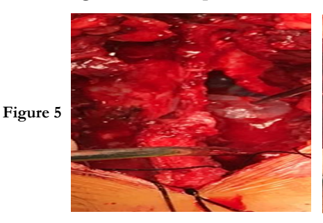
Figure 5-6: Intraoperativeview of the cyst after hemilaminectomy.

OPEN ACCESS https://scidoc.org/IJBRR.php