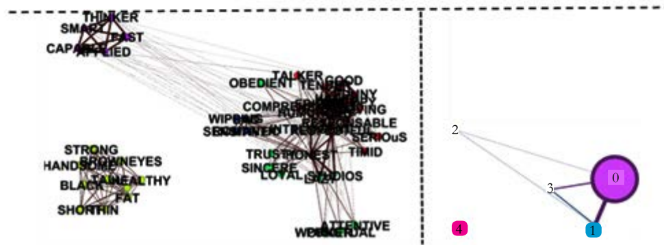
Table 1. Inclusion of Concept Definers Through Different Clusters.