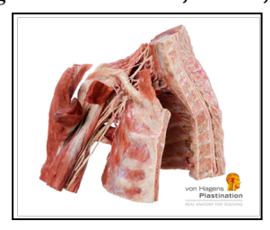
Figure 3. Taking many hours to clean away the attached, but unwanted skin and, fascial tissues one is left with an artist's impression providing one specific point of view. An artifact, an object, a part, an isolated 'thing' is void of the living reality of continuity and connectedness. While this specimen can be a useful educational aid it must be stressed this is an artistic view that requires the removal of the fascia net to better expose the neurovascular anatomy within.[Image; Special thanks to von Hagen's Plastinarium, Guben, Germany].