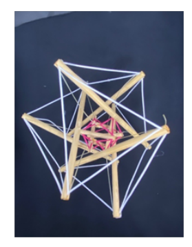
Figure 2. The human body is organized in nested tensegrity networks formed micro to macro and constructed of systems within systems. This image shows a tensegrity nested within a tensegrity as a visual representation of an architecture that is scale free.

The word biomechanics is clear in its intension to describe the combined inner workings that result in living motion as a result of movement around a fixed axis. Bio, referring to living constructs and mechanics or mechanical, from the Greek 'mechanike', meaning to study the mechanical theories and principles of living organisms [3]. Mechanical constructs require a screw or pin to stabilize and fixate separate components to support operation as a whole and therefore falls short of a satisfactory explanation for human movement [3]. Nature has had the required time to work out the most ephemeral way, combined with self-emergence via self-development, to provide a continuous anatomy, unbroken and uninterrupted, necessary for energy efficient motion [3]. Inappropriate oscillations, a result of strong winds, created a sway that destroyed the Tacoma Narrows Bridge in 1940. Every human cell oscillates at its own specific frequency ensuring differentiation and healthy physiology [34]. Embryologically, motion occurs before consciousness, and it is believed that movement may be the precursor to, and generator of, consciousness based on frequency specific oscillations/resonance [35]. A centrally originating oscillation/resonance in the 10 Hz range has been shown to modulate slow digital movements and pre-emptive smooth eye movements [36]. The human construct avails of nested tensegrities providing